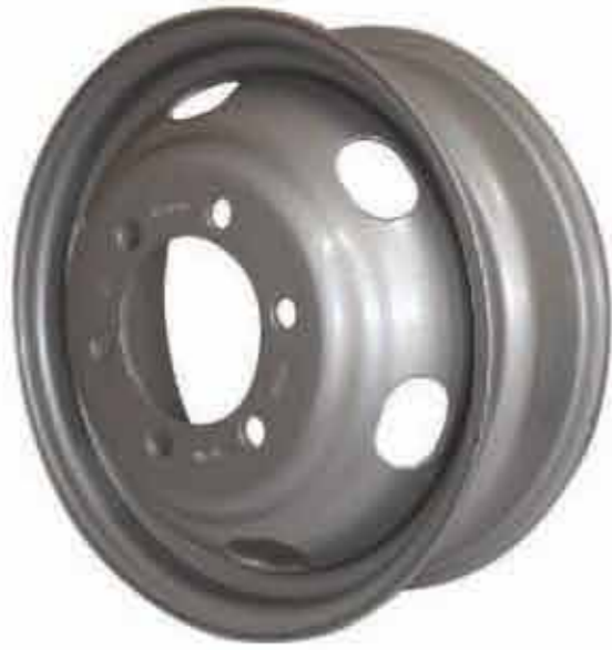
5.5 JK x 16 for Gazelle (ГАЗель)

Disc Wheels with 5° drop centre for tubeless tyres